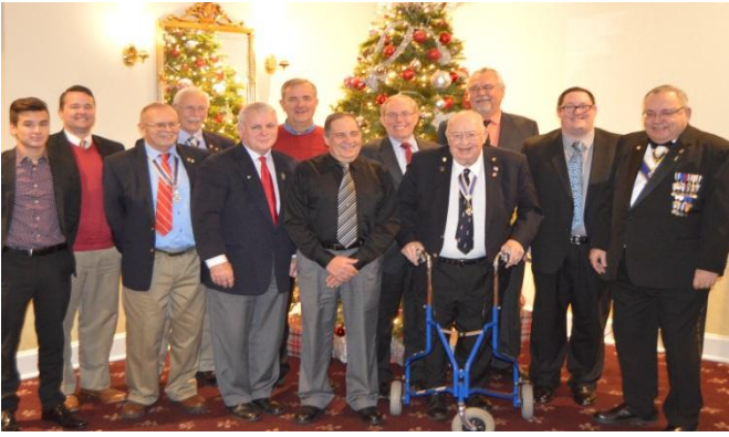
Group photo of chapter and prospective chapter member at the December 2015 Holiday Dinner